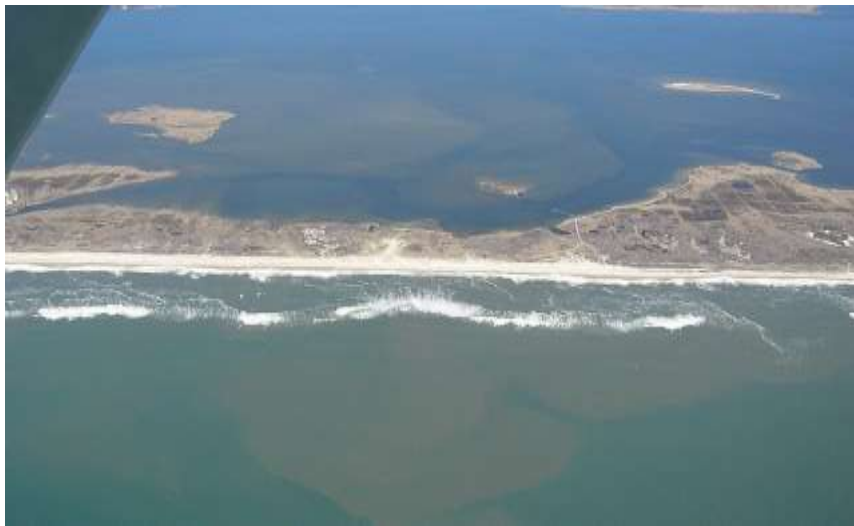
Pre Hurricane Sandy April 2009