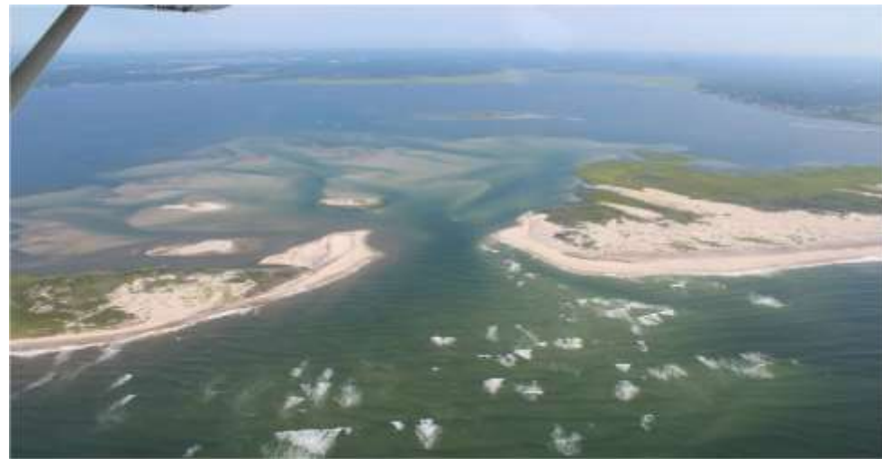
Post Hurricane Sandy Breach June 2013