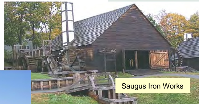
Saugus Iron Works