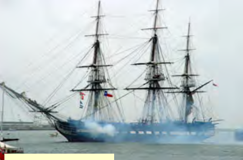
Boston NHP USS Constitution