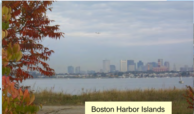
Boston Harbor Islands